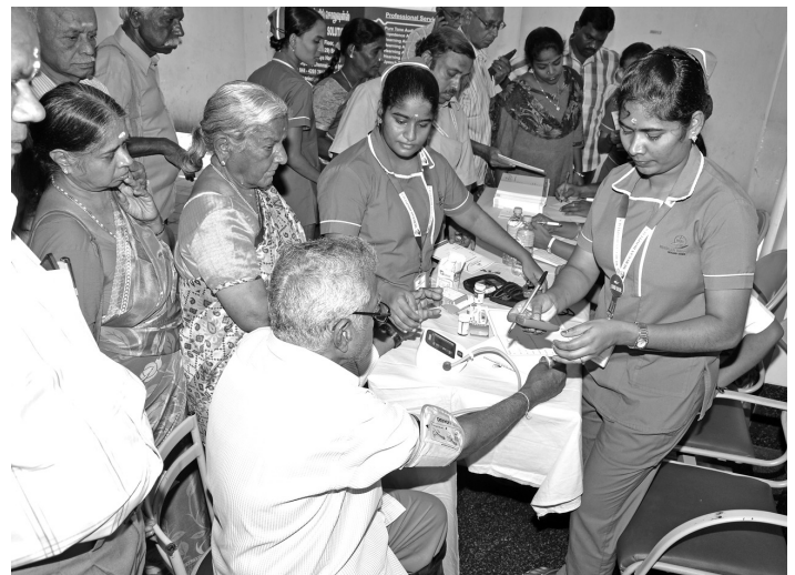
Health Monitoring Test

this multi various tests organised in an orderly manner in different rooms of this popular hospital in Kilpauk, which is growing in strength year by year. Our kudos to them as this the second year they came forward for this type of free camp.